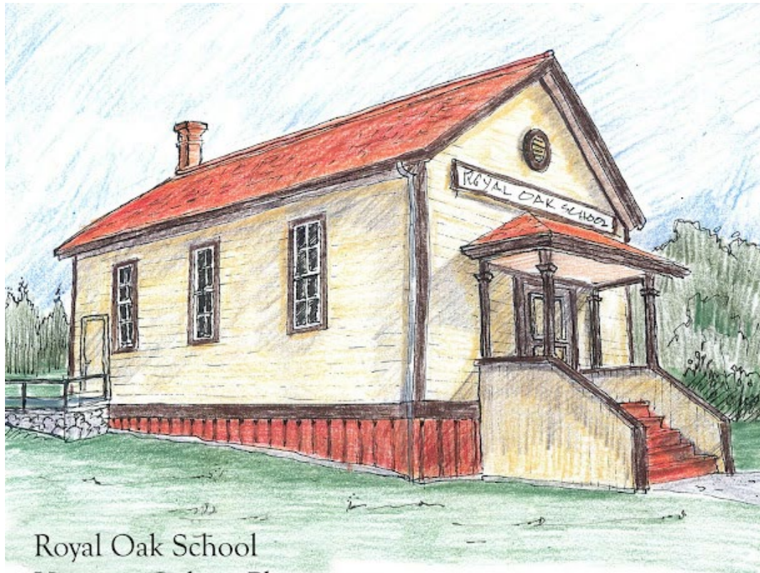
Royal Oak School Heritage Colour Placement Stuart Stark - Heritage Consultant - 2007